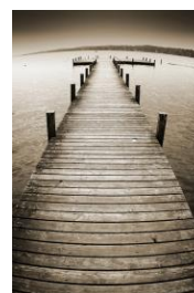
Pier Rental $325

There is no rental fee for use of the lodge if you are a member in good standing. A $100 cleaning deposit will be required.